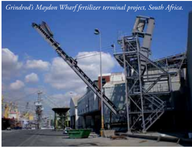
Grindrod's Maydon Wharf fertilizer terminal project, South Africa.

mounted conveyors stationed on the jetty at locations to suit the ship docking arrangements. Once the ships have been offloaded, the fertilizer is conveyed to a central pivoting and retractable boom conveyor.