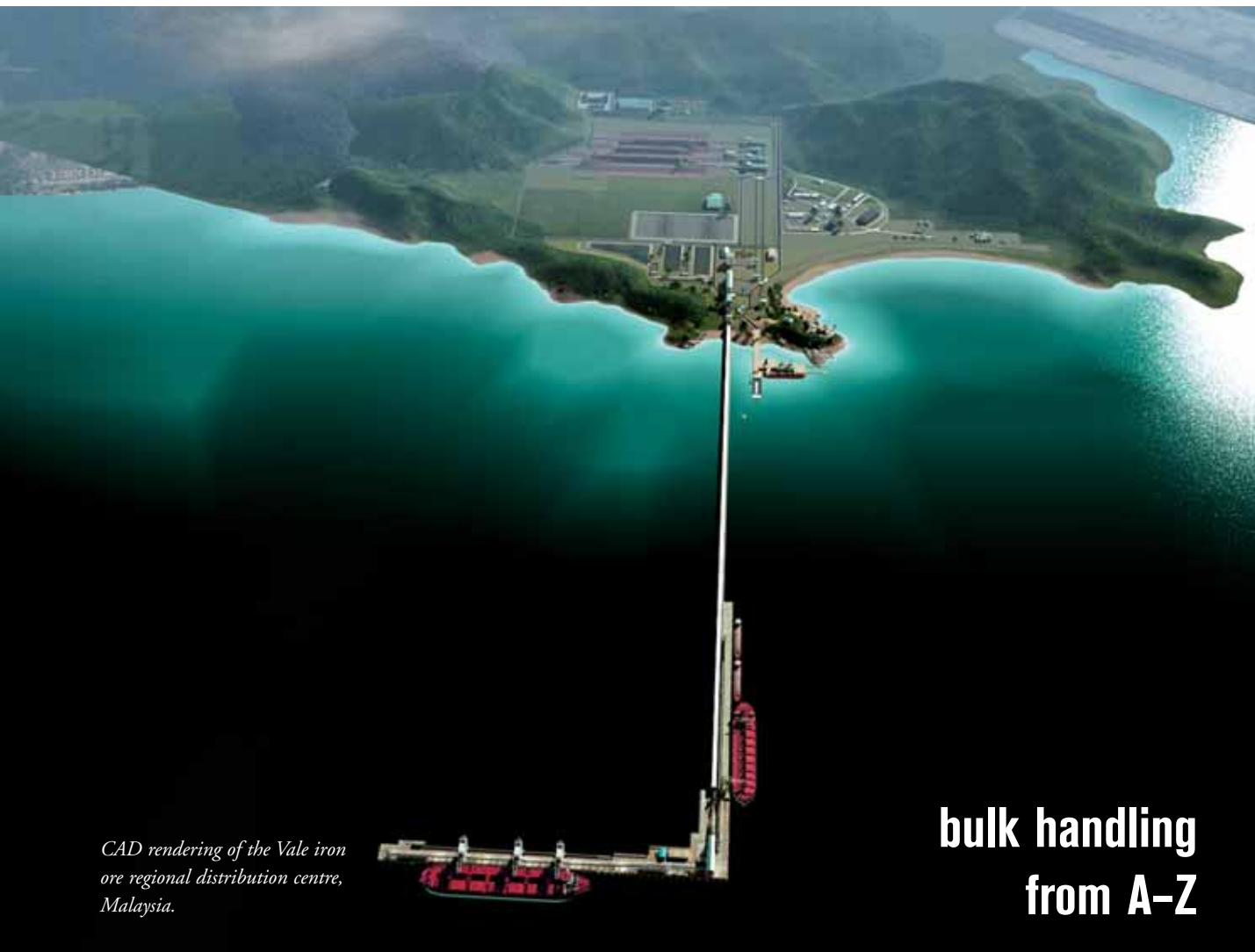
CAD rendering of the Vale iron ore regional distribution centre, Malaysia.