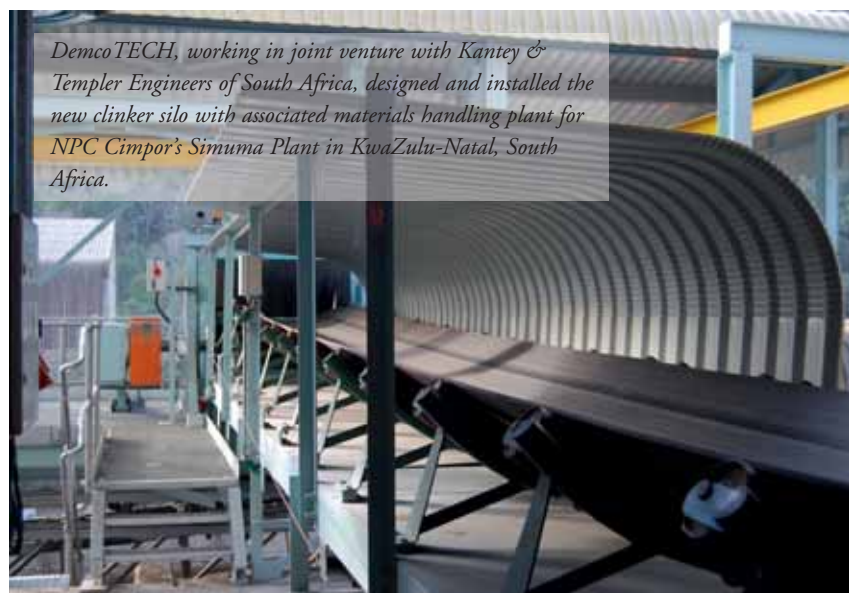
DemcoTECH, working in joint venture with Kantey & Templer Engineers of South Africa, designed and installed the new clinker silo with associated materials handling plant for NPC Cimpor’s Simuma Plant in KwaZulu-Natal, South Africa.

“Pipe conveyors are ideally suited to the cement industry, offering opportunities to reduce the number of conveyor flights, eliminate transfer points, minimise spillage and dust generation, reduce the conveying distance and save total costs, while at the same time addressing the environmental requirements.”