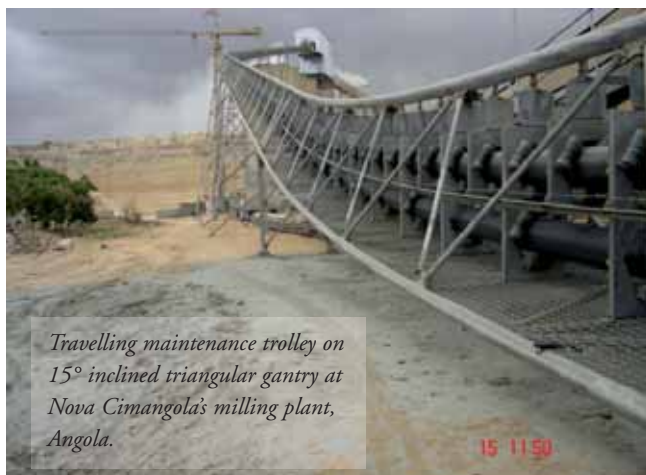
Travelling maintenance trolley on 15° inclined triangular gantry at Nova Cimangola's milling plant, Angola.

located alongside its raw material source, limestone, in the Oribi Gorge area of South Africa's KwaZulu-Natal province.