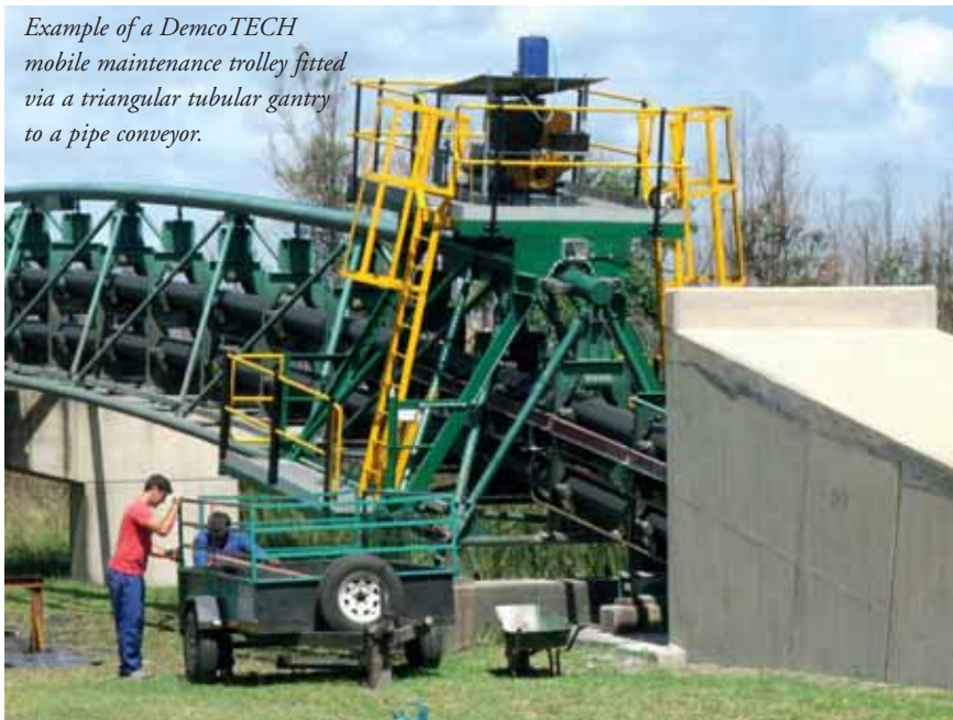
Example of a DemcoTECH mobile maintenance trolley fitted via a triangular tubular gantry to a pipe conveyor.

site. The trolleys are self-propelled by an on-board generator and include hydraulically driven travel mechanisms for a high level of control. The trolley designs include a number of safety features such as fully enclosed access facilities, emergency brake systems and heavy duty traction control.